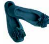
petrol | petrol