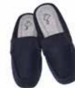
dunkelblau | navy