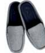
kies | gravel