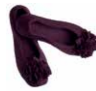
bordeaux | bordeaux