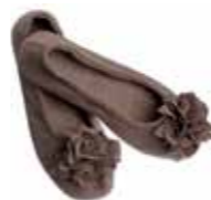
trüffel | truffle