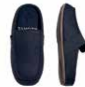
anthrazit | charcoal