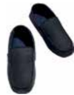
anthrazit | charcoal