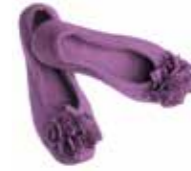
cyclam | cyclam