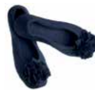
dunkelblau | navy