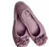
dunkle malve | dark mauve