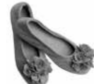
stein | stone