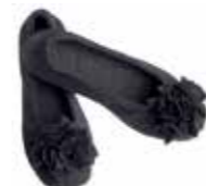
anthrazit | charcoal