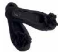
schwarz | black