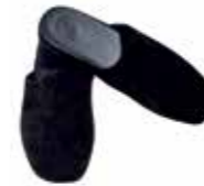
schwarz | black