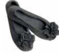
kies | gravel